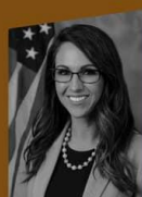
Lauren Boebert Colorado