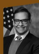
George Santos New York