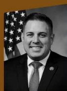
Anthony D'Esposito New York