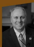
Steve Scalise Louisiana