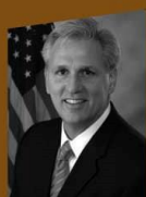
Kevin McCarthy California