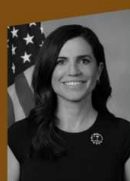
Nancy Mace South Carolina