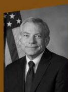
David Schweikert Arizona