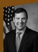
Thomas Kean New Jersey