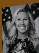
Marjorie Taylor Greene Georgia