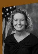
Jen Kiggans Virginia